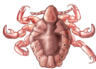
A Pubic Louse (Crab)